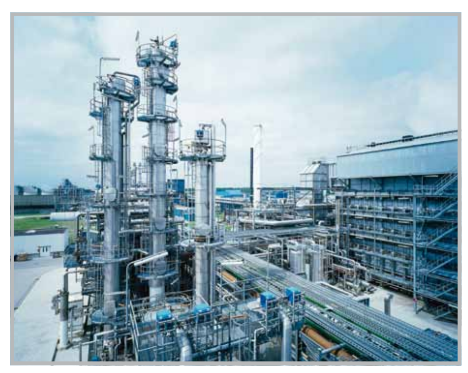
Complex construction of industrial plant make it difficult to locate endangered employees via GPS, it requires a individualized systems to locate.

Final conclusion by the project manager: "Thanks to ecom instruments and Mobile Track, we as a gas manufacturer now possess one of the most innovative and reliable lone-worker-protection Zone-1 solutions currently available. Which means that our workers are most certainly safe!"