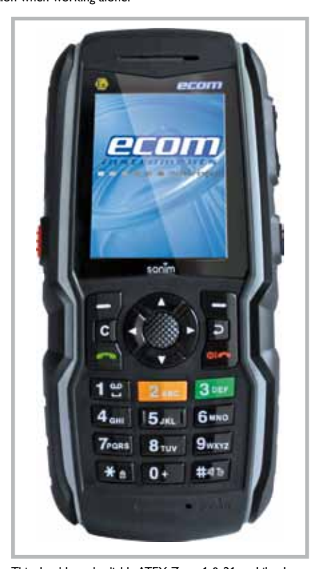
This durable and reliable ATEX Zone 1 & 21 mobile phone is packed with new features that deliver world class connectivity, flexibility and safety. The phone also comes with an extended battery option, but vibration alert and exceptional build quality are standard.

"With ecom instruments, the expert for explosion-protected mobile high-end devices, and Mobile Track, the specialist for individual tracking systems, two competent partners were requested to solve this problem," explained the project manager, responsible for the project at the Gas manufacturer. These two companies worked together to set up a per-